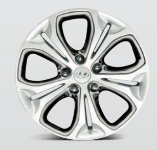
17" SE and SE with Tech Package Rim