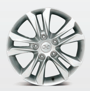
16" GLS Rim