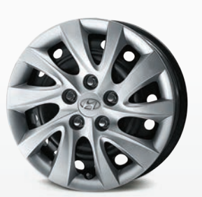
16" L and GL Rim