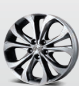
SE & 2.0T Limited with Ultimate Package Wheel