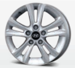
GL and GLS wheel