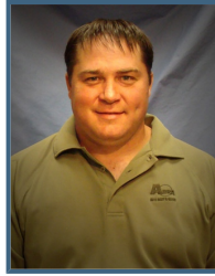
The featured employee for this month is