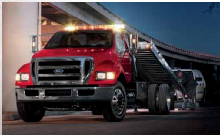
F-650 XLT REGULAR CAB UPFITTED FOR FLATBED TOWING