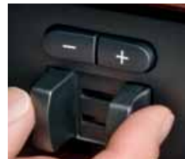
TRAILER BRAKE CONTROLLER