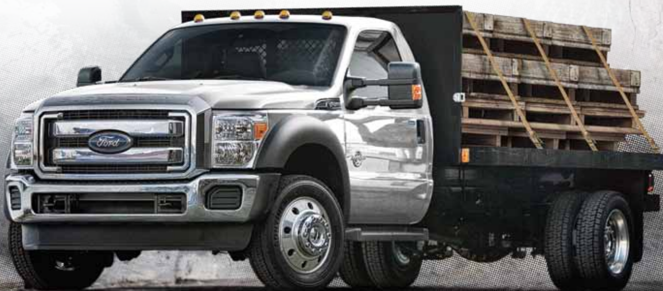
F-450 XLT CHASSIS CAB WITH A FLAT BED UPFIT

TORQSHIFT® SELECTSHIFT™ TRANSMISSION MODES AUTOMATIC OR FULL MANUAL – SELECT THE MODE THAT’S BEST FOR YOUR APPLICATION