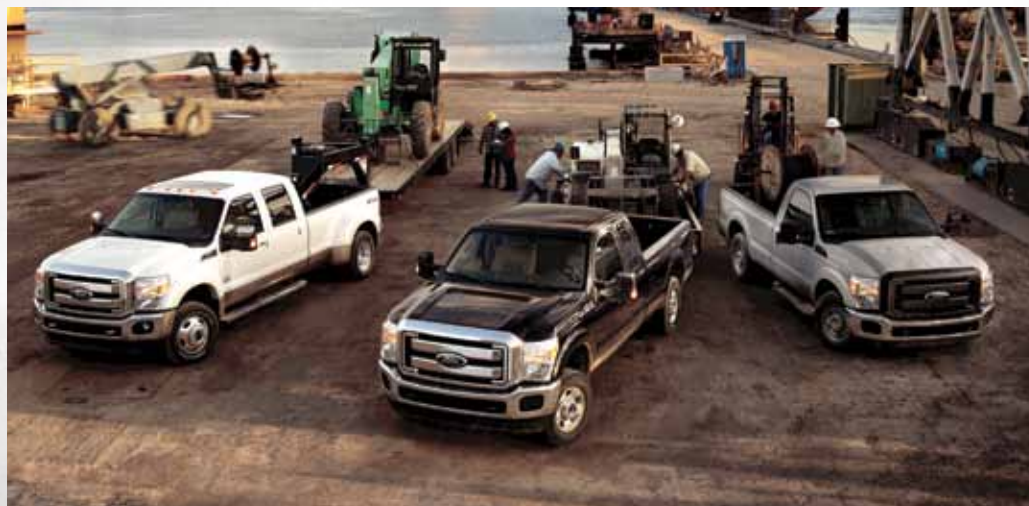
F-450 LARIAT CREW CAB, F-350 XLT SUPERCAB AND F-250 XL REGULAR CAB