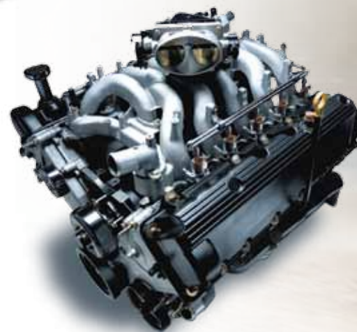
AVAILABLE CLASS-EXCLUSIVE 6.8L CNG/LPG FUEL CAPABLE GAS V10 ENGINE