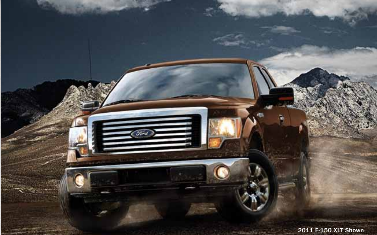
2011 F-150 XLT Shown