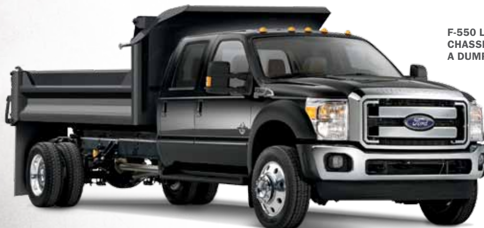
F-550 LARIAT CHASSIS CAB WITH A DUMP UPFIT