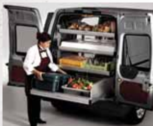
KATERACK INTERIOR SYSTEM