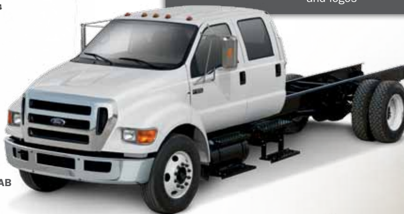
F-650 XL CREW CAB