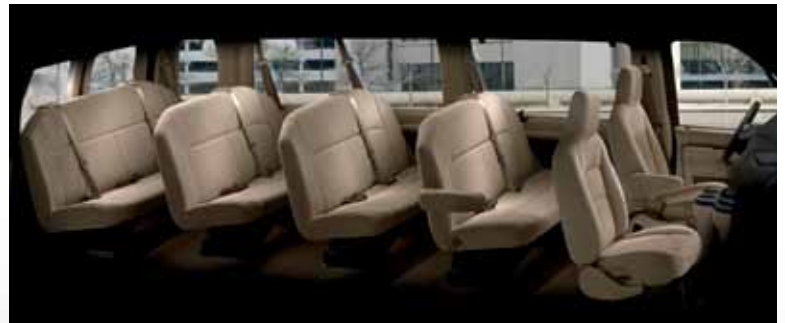
SEATING CONFIGURATIONS FOR UP TO 15