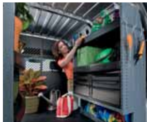
LEGGETT & PLATT SYSTEM