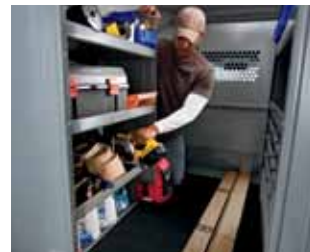
ADRIAN STEEL SYSTEM