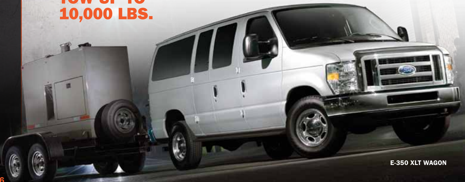
E-350 XLT WAGON