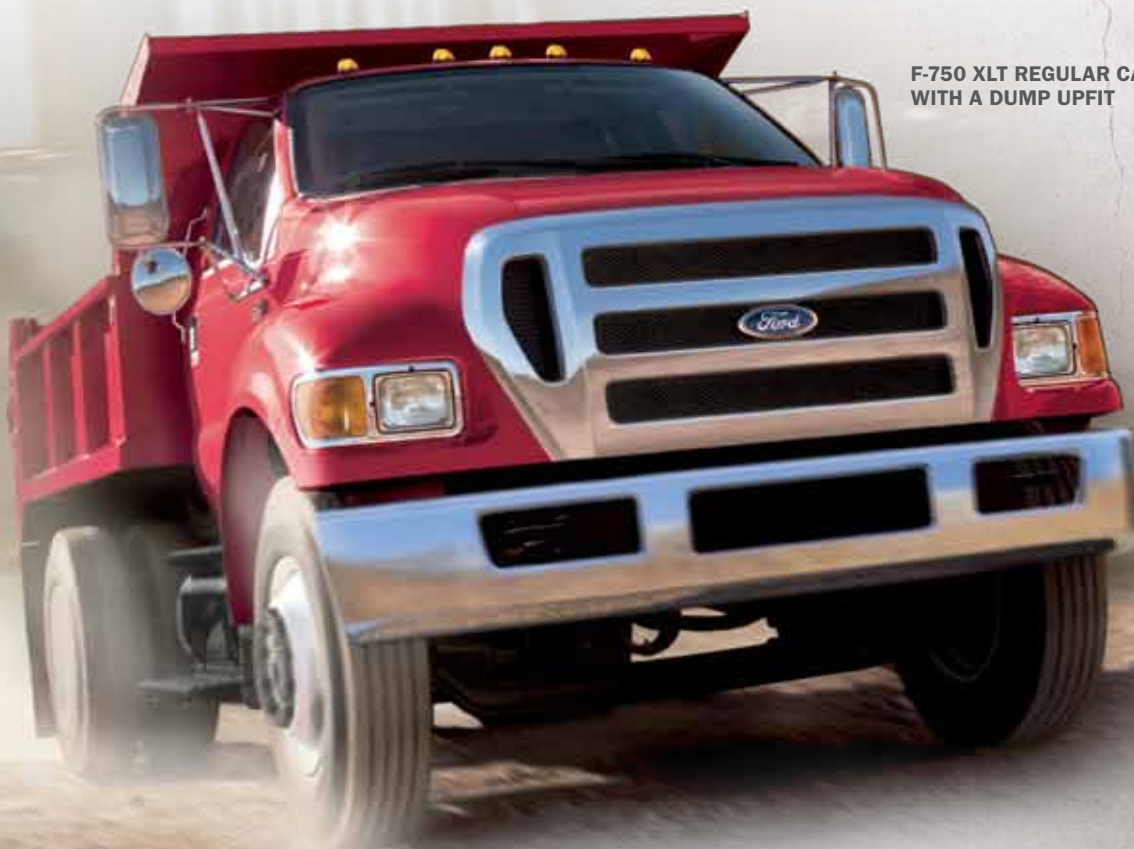
F-750 XLT REGULAR CAB WITH A DUMP UPFIT