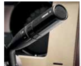
SELECTSHIFT TOW HAUL