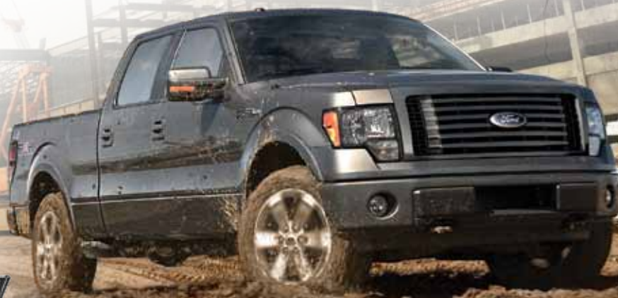
F-150 FX4 SUPERCREW