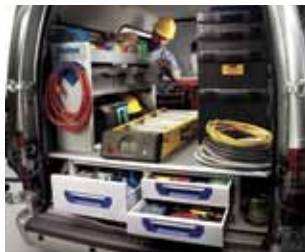
SORTIMO INTERIOR SYSTEM