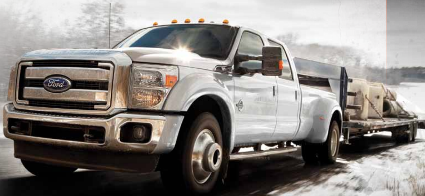
F-450 LARIAT CREW CAB