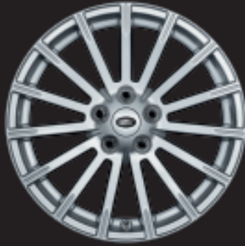
19 INCH 15-SPOKE ALLOYS 'STYLE 5'*