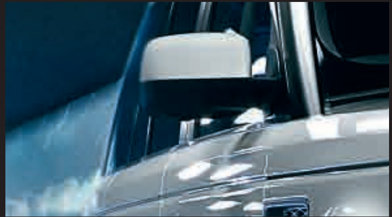
New Surround Camera System technology, which provides a near 360 degree view around the vehicle, utilizes five discreetly placed lenses, two in the front bumper, one in each of the wing mirrors and one in the rear spoiler.