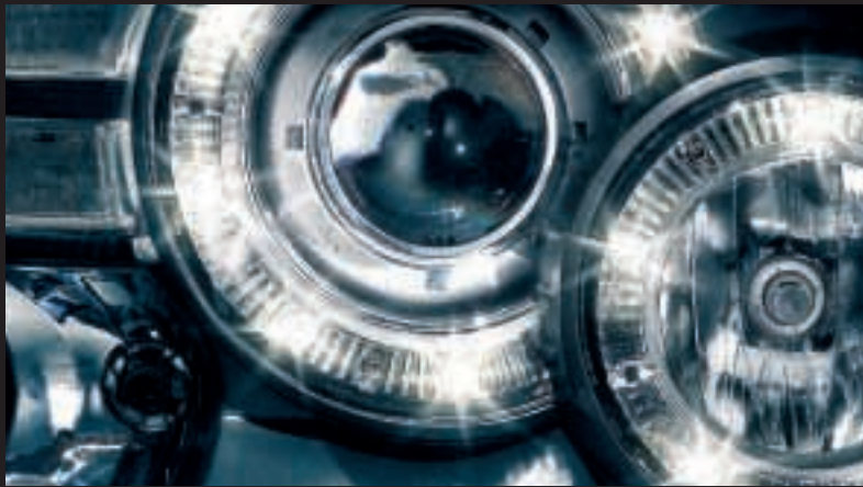
Automatic headlamps with high beam assist detect vehicle headlamps/tail lamps and dip the high beam until the light source is out of range.