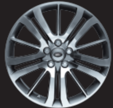
20 INCH 15-SPOKE ALLOYS DIAMOND TURNED FINISH 'STYLE 4'