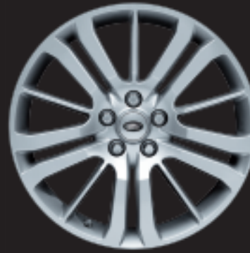
20 INCH 15-SPOKE ALLOYS 'STYLE 3'