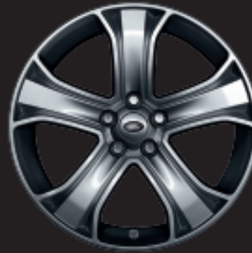
20 INCH 5-SPOKE ALLOYS DIAMOND TURNED FINISH 'STYLE 7'*