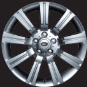
20 INCH 9.5J 'STORMER' ALLOYS 'STYLE 2'