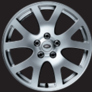
19 INCH 5 V-SPOKE ALLOYS OFF-ROAD WHEEL 'STYLE 1'