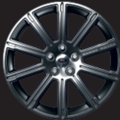
20 INCH POLISHED 10-SPOKE ALLOYS 'STYLE 12' OPTIONAL SUPERCHARGED AND AUTOBIOGRAPHY WHEEL