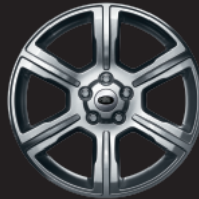
20 INCH 6-SPOKE ALLOYS DIAMOND TURNED FINISH 'STYLE 14' STANDARD AUTOBIOGRAPHY WHEEL

Please note: When choosing vehicles fitted with specific wheel and tire combinations or optional wheels and tires, your intended use of the vehicle should be considered. Wheels with larger diameters and lower profile tires may offer certain styling or driving benefits, but may be more vulnerable to damage, please discuss your requirements with a Retailer when selecting your vehicle and specification.