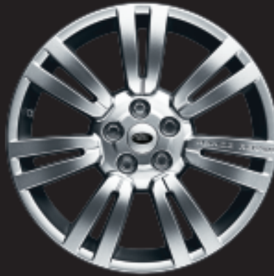
20 INCH V-SPOKE ALLOYS 'STYLE 9' STANDARD HSE W/LUX WHEEL