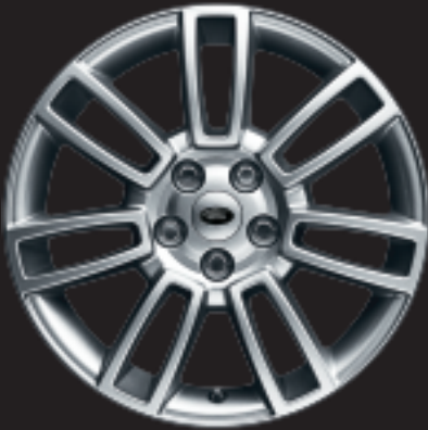
19 INCH TWIN 7-SPOKE ALLOYS 'STYLE 8' STANDARD HSE WHEEL