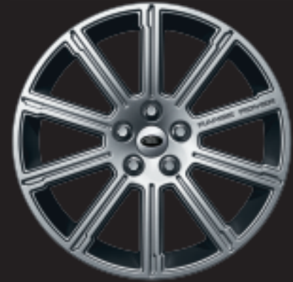
20 INCH 10-SPOKE ALLOYS 'STYLE 11' STANDARD SUPERCHARGED WHEEL