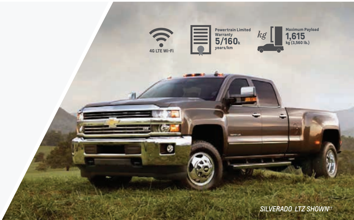
SILVERADO LTZ SHOWN**