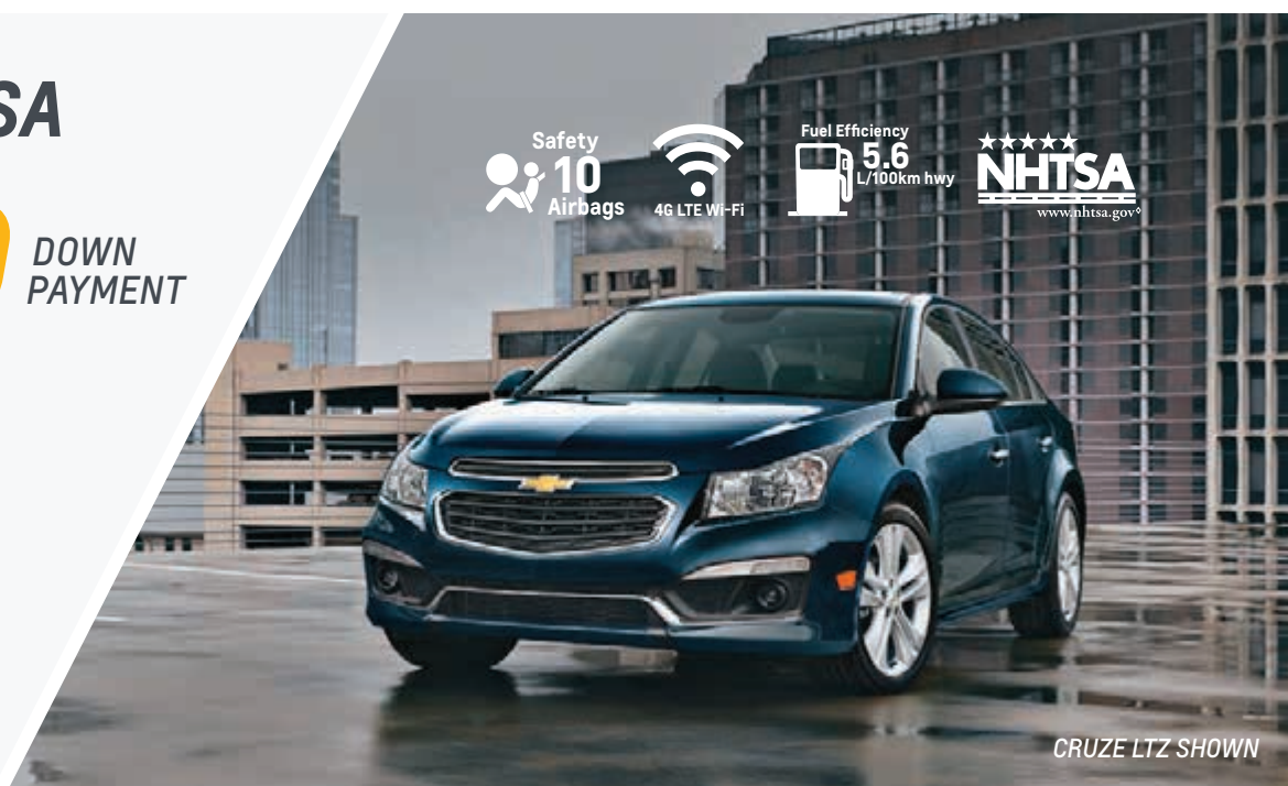
CRUZE LTZ SHOWN