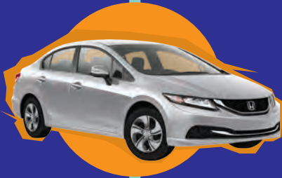
2014 Honda Civic