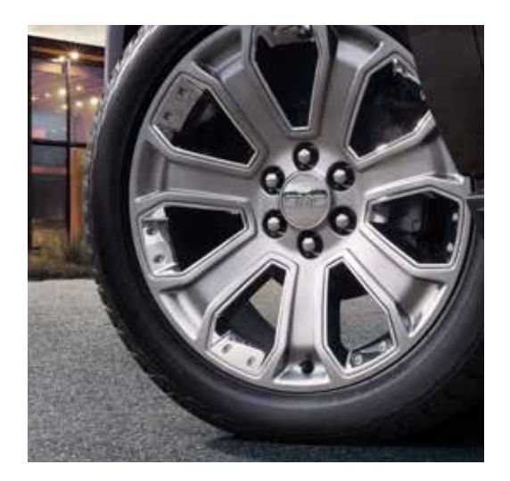
WHEEL STYLING Yukon's new exterior design is fully complemented with an equally striking selection of available 18," 20" and, on Denali, 22" wheels in various finishes.