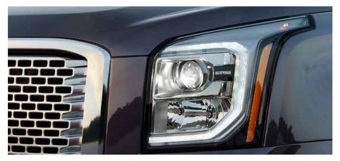
SIGNATURE LIGHTING Yukon introduces new projector-beam headlights (HID on Denali). They create a distinctive appearance, with front and rear "C"-shaped LED signature lighting.