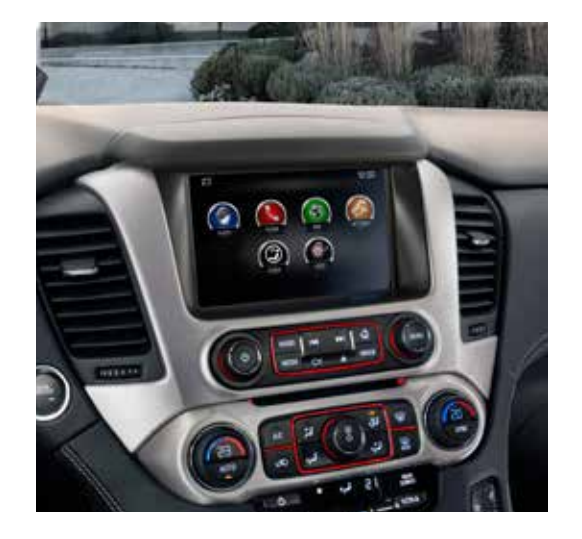
PERSONALIZED ENTERTAINMENT Yukon features the new GMC 203 mm (8") diagonal Colour Touch Sound System with IntelliLink3 Featuring a full-colour screen, IntelliLink adds hands-free, voice-activated control of your communication and entertainment. Stream Internet radio4 through your smartphone or sync your MP3 music library. My Media connects media libraries from multiple devices in Yukon. You can even store frequently used phone contacts for quick access.