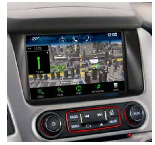
VOICE AND TOUCH-SCREEN NAVIGATION<sup>1</sup> In response to your voice or touch commands, Yukon's available Navigation System displays 2-D or 3-D map graphics on the 203 mm (8") diagonal centre-mounted screen. NavTraffic<sup>2</sup> (3 trial months of SiriusXM) incorporates real-time traffic and road conditions into the screen, directing you toward the most efficient route.