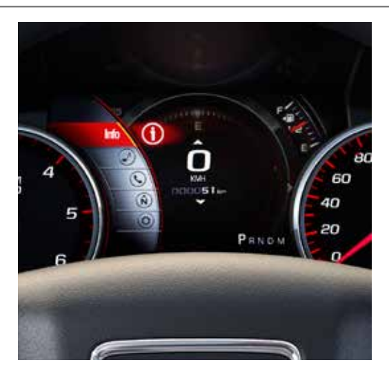
CUSTOMIZABLE DRIVER DISPLAY Choose Yukon Denali, and a reconfigurable gauge cluster allows you to personalize the new 203 mm (8") diagonal colour Customizable Driver Display for optimized information placement. The display's menu can be navigated with steering-wheel-mounted controls. Driver alerts are also clearly displayed.