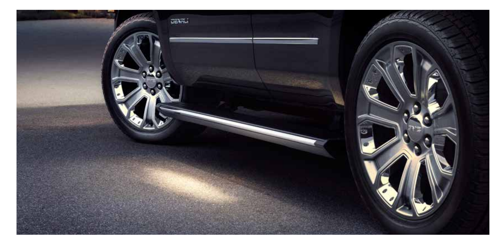
POWER-RETRACTABLE ASSIST STEPS WITH PERIMETER LIGHTING Yukon Denali models offer illuminated power-retractable assist steps that automatically extend when the front- or second-row doors are opened to provide easy, lighted access. They retract when the doors close for an uncluttered profile.

Yukon's bold lines and striking looks are complemented by design innovations such as available illuminated assist steps and a rear window wiper concealed under the spoiler. These options show that when limits are pushed, there's no compromise between convenience and style.