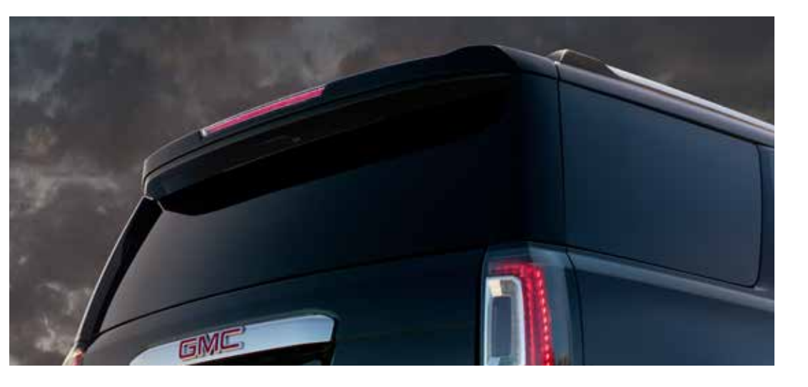
REAR SPOILER Located on top of the liftgate, the new spoiler houses a repositioned window wiper that is hidden when not in use for a clean, uncluttered appearance.