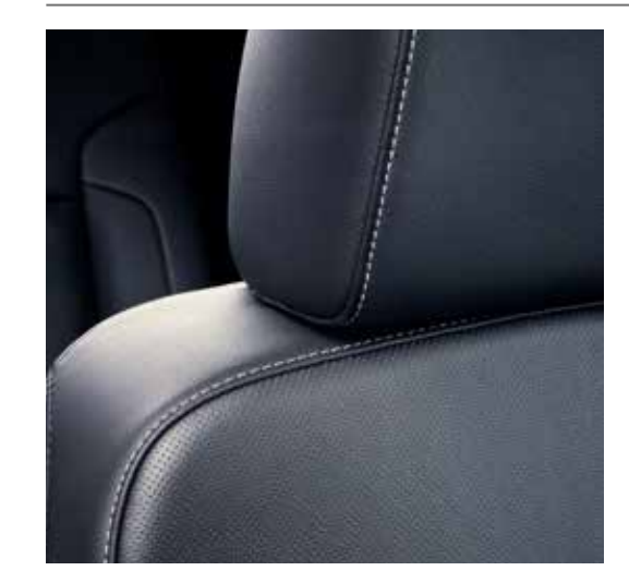
PREMIUM SURROUNDINGS Yukon surrounds you with a soft-touch instrument panel, console and door panel materials, and comfortable, durable perforated leather-appointed seats with contrasting French seam stitching available on select trims.

Attention to the details of every detail makes Yukon your ultimate travelling companion. It's loaded with features to not only surprise but delight you with their convenience, appearance and enjoyment.