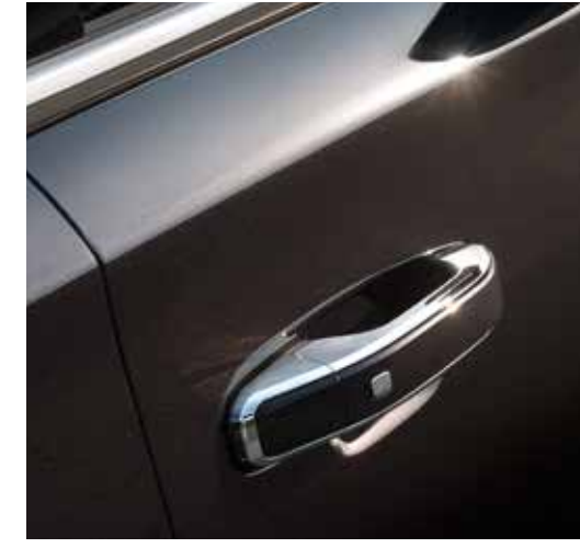
PASSIVE ENTRY With Yukon's key fob in your pocket, its available passive entry system allows access to all four doors as well as the liftgate. Then, upon exit, this feature will automatically lock the vehicle several seconds after all doors are closed.