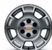
17" Aluminum (Standard on LS, 1LT and 2LT)