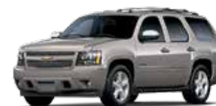
GHA - MOCHA STEEL METALLIC