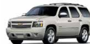
GWT - CHAMPAGNE SILVER METALLIC†