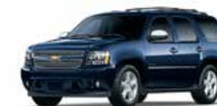
GWU - CONCORD METALLIC†

* Available at extra cost. ** Available on LTZ only. † Not available with Z71 Off-Road Suspension Package.