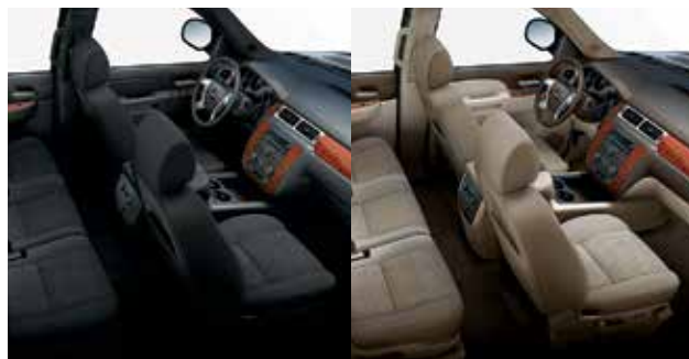
Ebony Premium Cloth 1