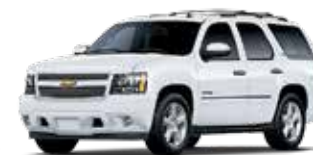
50U - SUMMIT WHITE