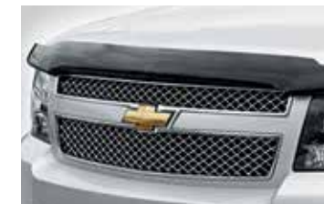
Moulded Hood Protector