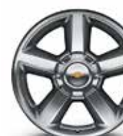
20" Polished-Aluminum (Standard on LTZ; available on 1LT and 2LT)