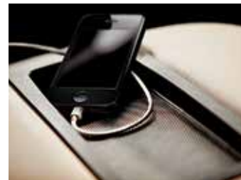
USB connectivity 3