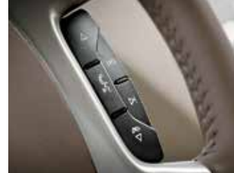
Bluetooth® hands-free calling.