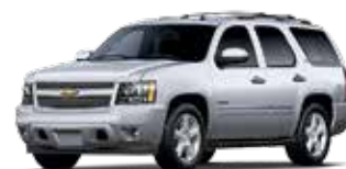
GAN - SILVER ICE METALLIC