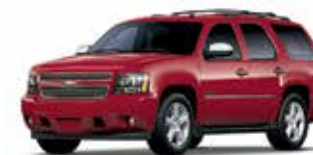
89U - CRYSTAL RED TINTCOAT*