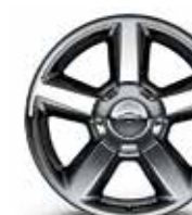
20" Chrome-Aluminum (Available on LTZ)