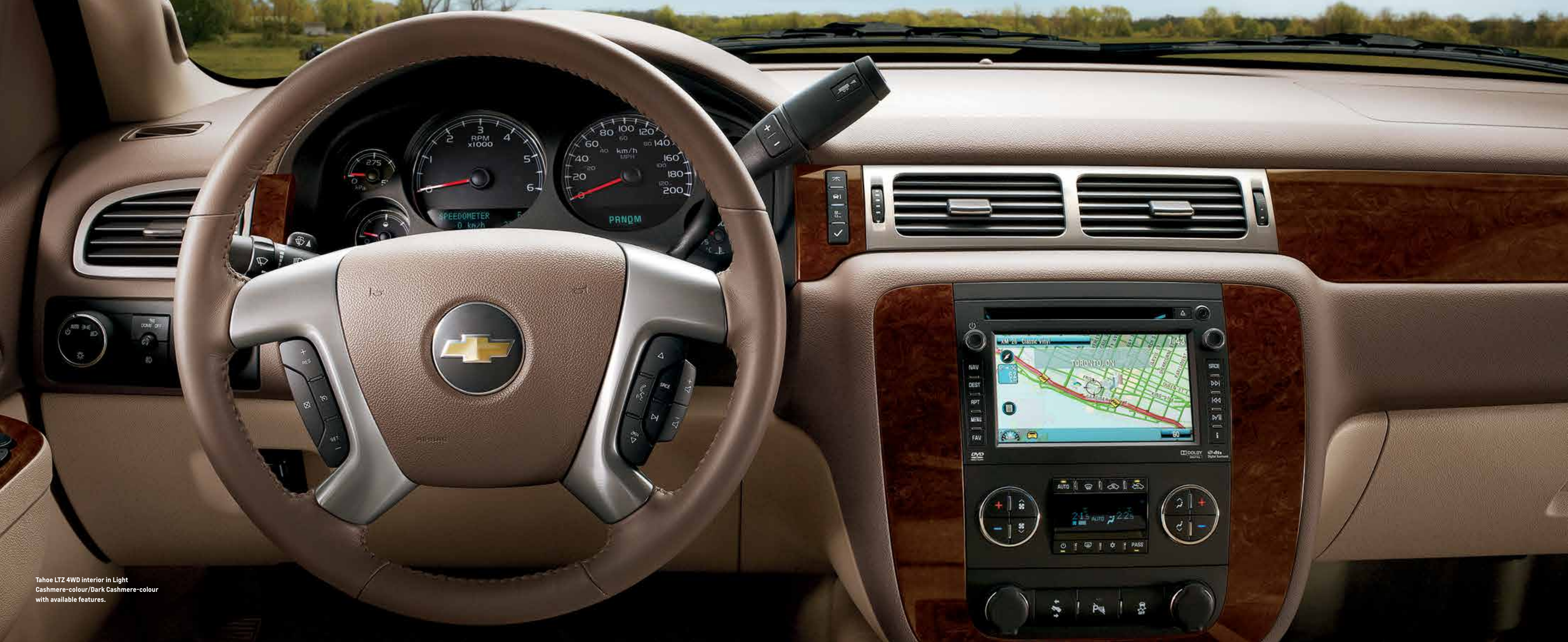
Tahoe LTZ 4WD interior in Light Cashmere-colour/Dark Cashmere-colour with available features.