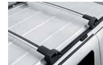
Roof Rack Cross Rail Package