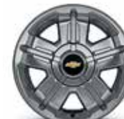
18" Aluminum (Available on 1LT and 2LT; requires available Z71 Off-Road Suspension Package)