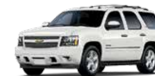
98U - WHITE DIAMOND TRICOAT**