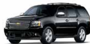
41U - BLACK