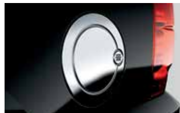
Chrome Fuel Door

PERSONALIZE YOUR TAHOE OR SUBURBAN AT CHEVROLET.CA