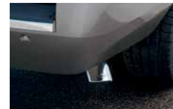
Highly Polished Exhaust Tip