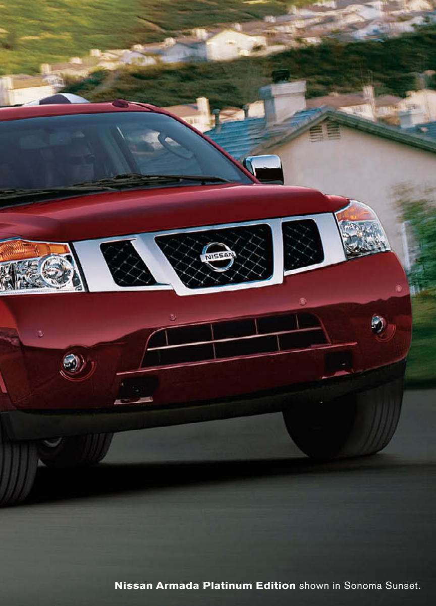
Nissan Armada Platinum Edition shown in Sonoma Sunset.