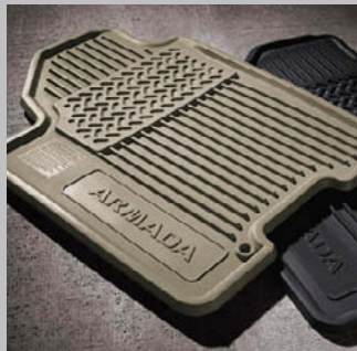
All-season Rubber Floor Mats