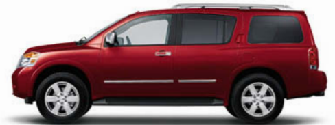
Sonoma Sunset 1 NAD