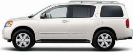
Nordic White 1 Q10