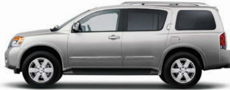
Silver Mist 1 K12