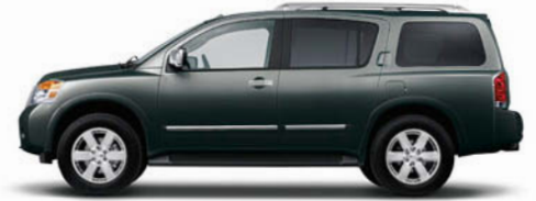
Smoke 1 K11