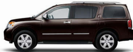
Kona Bean 1,3 CAE