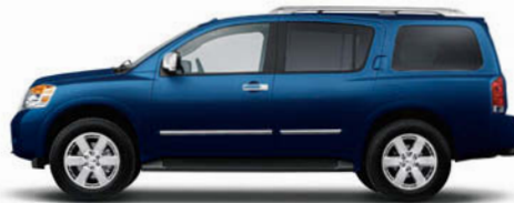
Ink Blue 1,2 RAB