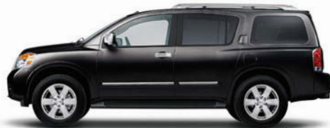
Galaxy 1 G10