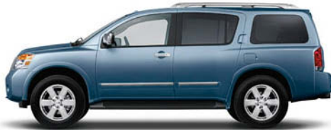
Ocean Wash 1 B30