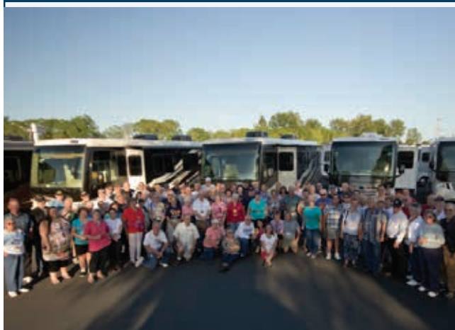
Attendees of the Northwest Adventure Rally • May 2013