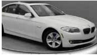
2013 BMW 528 I $43,479 12652