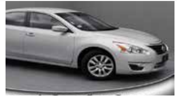
2013 NISSAN ALTIMA 2.5 $18,495 12674