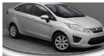
2013 FORD FIESTA SE $15,000 12685