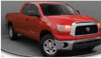
2008 TOYOTA TUNDRA 5.7L V8 $17,700 12666