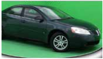
2006 PONTIAC G6 6 CYL. $7,995 51202a