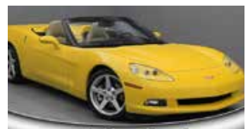
2006 CHEVROLET CORVETTE 2DR CONV $35,000 12681