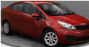
2012 KIA RIO LX $13,988 12693