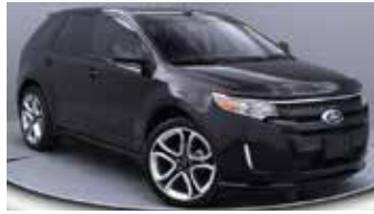
2011 FORD EDGE SPORT $28,988 12684