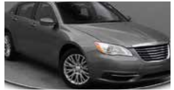
2012 CHRYSLER 200 LX $15,000 12692