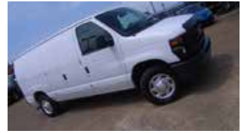
2013 FORD E-150 E-150 COMMERCIAL $18,988 12608