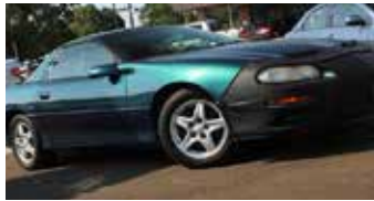
1998 CHEVROLET CAMARO 2DR CPE $3,988 12485d