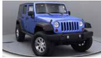
2010 JEEP WRANGLER UNLIMITED SPORT $28,988 51120c