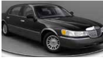
2001 LINCOLN TOWN CAR CARTIER L $5,495 12687

CLICK ON ANY VEHICLE FOR MORE INFORMATION!!!