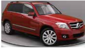
2011 MERCEDES-BENZ GLK350 GLK 350 $28,988 12678a