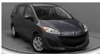
2013 MAZDA MAZDA5 SPORT $16,988 12694