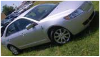
2012 LINCOLN MKZ CERTIFIED PRE-OWNED $22,988 12579