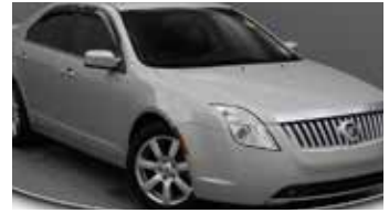
2010 MERCURY MILAN PREMIER $12,988 12657a