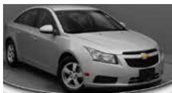
2012 CHEVROLET CRUZE LT W/1FL $15,988 12691