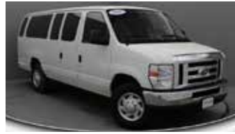
2011 FORD E-350 SUPER DUTY E-350 SUPER DUTY EXT XL $19,977 12642