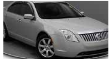
2010 MERCURY MILAN PREMIER $12,988 12657a