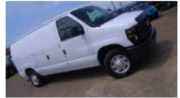
2013 FORD E-150 E-150 COMMERCIAL $18,988 12608