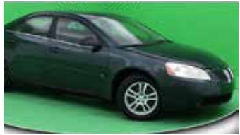
2006 PONTIAC G6 6 CYL. $7,995 51202a