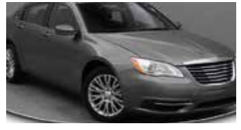
2012 CHRYSLER 200 LX $15,000 12692