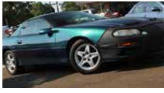
1998 CHEVROLET CAMARO 2DR CPE $3,988 12485d