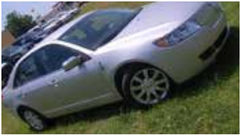
2012 LINCOLN MKZ CERTIFIED PRE-OWNED $22,988 12579