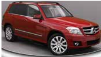
2011 MERCEDES-BENZ GLK350 GLK 350 $28,988 12678a