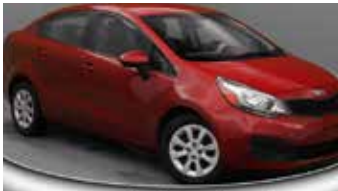
2012 KIA RIO LX $13,988 12693