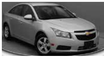
2012 CHEVROLET CRUZE LT W/1FL $15,988 12691