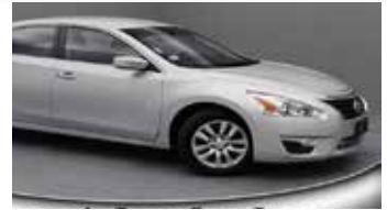
2013 NISSAN ALTIMA 2.5 $18,495 12674