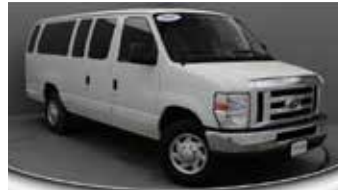
2011 FORD E-350 SUPER DUTY E-350 SUPER DUTY EXT XL $19,977 12642