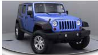
2010 JEEP WRANGLER UNLIMITED SPORT $28,988 51120c