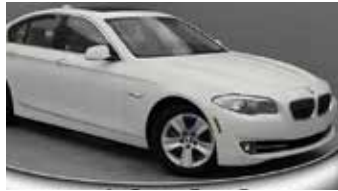
2013 BMW 528 I $43,479 12652