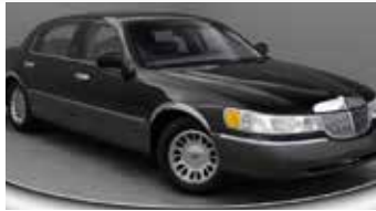
2001 LINCOLN TOWN CAR CARTIER L $5,495 12687

CLICK ON ANY VEHICLE FOR MORE INFORMATION!!!