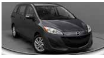
2013 MAZDA MAZDA5 SPORT $16,988 12694