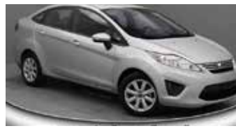
2013 FORD FIESTA SE $15,000 12685