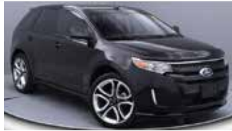
2011 FORD EDGE SPORT $28,988 12684