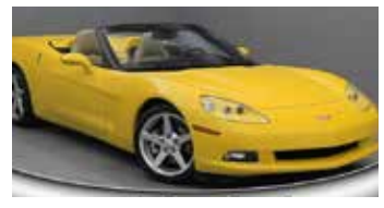
2006 CHEVROLET CORVETTE 2DR CONV $35,000 12681