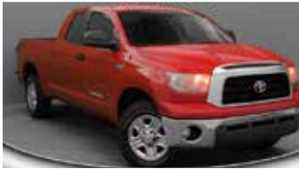
2008 TOYOTA TUNDRA 5.7L V8 $17,700 12666