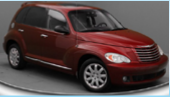
2007 CHRYSLER PT CRUISER LIMITED $9,850 12342