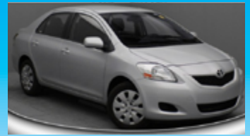
2012 TOYOTA YARIS 4DR SDN AUTO $12,000 12759