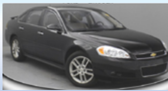
2013 CHEVROLET IMPALA LTZ $16,000 12765