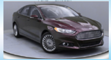
2013 FORD FUSION TITANIUM $24,900 12722