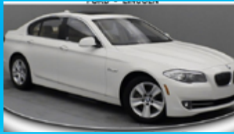
2013 BMW 528 I $42,000 12652