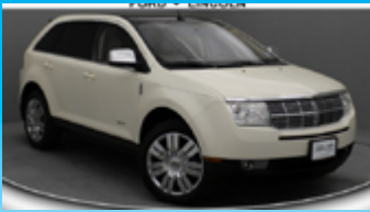
2008 LINCOLN MKX AWD 4DR $19,500 12739a