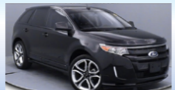
2011 FORD EDGE SPORT $26,950 12684