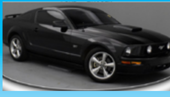
2007 FORD MUSTANG GT $16,988 b12744