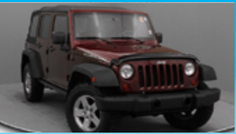
2010 JEEP WRANGLER UNLIMITED RUBICON $28,000 50908c