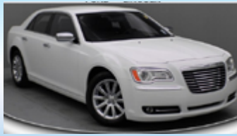
2013 CHRYSLER 300C 4DR SDN 300C RWD $25,800 12720