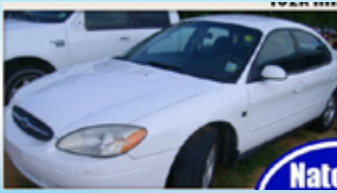
2001 FORD TAURUS SES $4,950 12147a