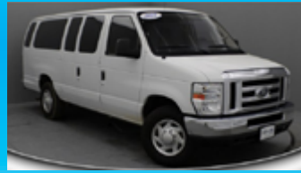
2011 FORD E-350 SUPER DUTY E-350 SUPER DUTY EXT XL $19,350 12642