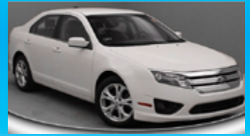
2012 FORD FUSION SE $15,700 12628