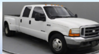
2001 FORD F-350 XLT $12,700 12654