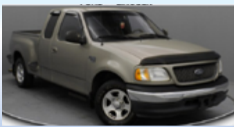
2001 FORD F-150 XLT $3,988 51260b