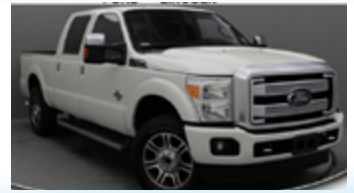
2013 FORD F-250 PLATINUM $51,900 51231a