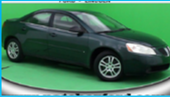
2006 PONTIAC G6 6 CYL. $8,150 51202a