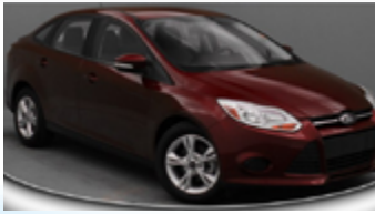
2013 FORD FOCUS SE $15,500 12783

CLICK ON ANY VEHICLE FOR MORE INFORMATION!!!