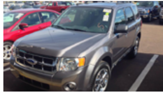
2012 FORD ESCAPE XLT $18,000 12785