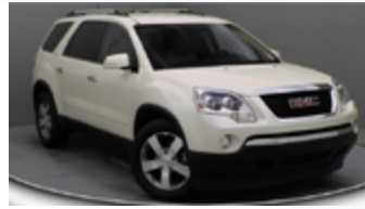
2011 GMC ACADIA AWD 4DR SLT1 $24,500 51271a