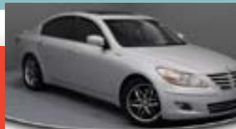
2009 HYUNDAI GENESIS 4.6 $18,999 51355g