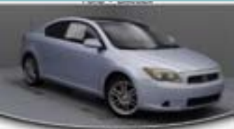
2006 SCION TC 3DR HB AUTO $6,995 51512d