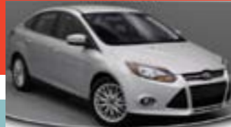
2013 FORD FOCUS TITANIUM $18,600 12951