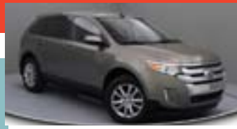
2012 FORD EDGE SEL $23,500 13028