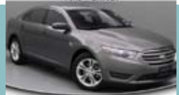
2013 FORD TAURUS SEL $17,500 12906