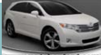
2010 TOYOTA VENZA V6 $22,700 51300b