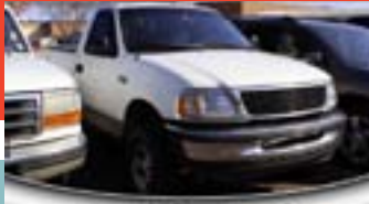
1998 FORD F-150 XLT $2,500 12775b