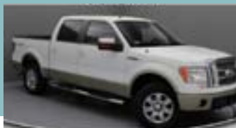
2009 FORD F-150 4WD SUPERCREW 145 LARIAT $25,000 51479a