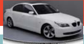
2009 BMW 528I 4DR SDN 528I RWD $18,400 51461b