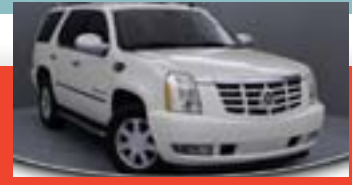
2007 CADILLAC ESCALADE 2WD 4DR $25,900 51504b