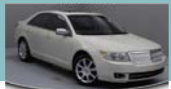
2007 LINCOLN MKZ 4DR SDN FWD $11,988 13017a