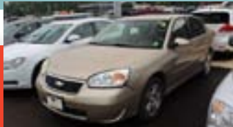
2006 CHEVROLET MALIBU LT W/2LT $7,500 51563d