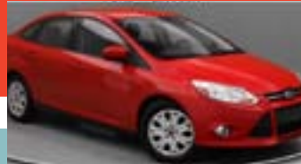
2012 FORD FOCUS SE $13,600 12943