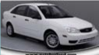
2006 FORD FOCUS ZX4 $6,995 b13002

CLICK ON ANY VEHICLE FOR MORE INFORMATION!!!