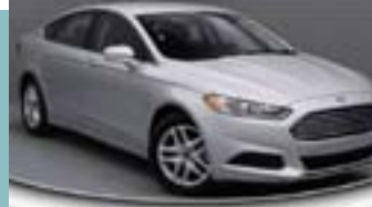
2014 FORD FUSION SE $21,300 12967