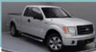
2012 FORD F-150 2WD SUPERCAB 145 STX $22,988 51606a