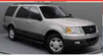
2006 FORD EXPEDITION 4 DR XLT 4WD $8,995 51581a