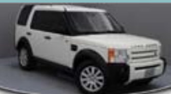
2006 LAND ROVER LR3 V8 SE $15,988 13035a