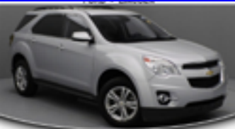
2012 CHEVROLET EQUINOX 2LT $19,500 12992