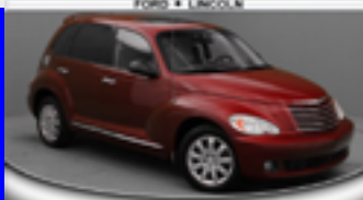
2007 CHRYSLER PT CRUISER LIMITED $6,999 12342