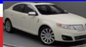
2011 LINCOLN MKS 4DR SDN 3.7L FWD $22,300 12934