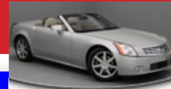
2005 CADILLAC XLR 2DR CONVERTIBLE $28,300 B12975