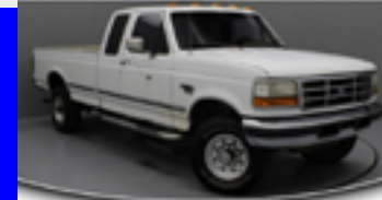
1997 FORD F-250 XL $5,000 51419F