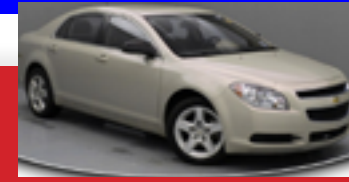
2011 CHEVROLET MALIBU LS W/1FL $11,500 51463A