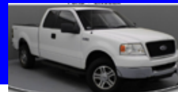
2005 FORD F-150 $9,800 B12946