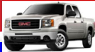
2009 GMC SIERRA 1500 4WD CREW CAB 143.5 SLT $33,500 B12959