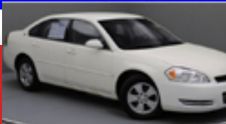
2007 CHEVROLET IMPALA LT W/3.5L $11,200 12878A