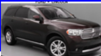
2012 DODGE DURANGO CREW $24,363 B12990