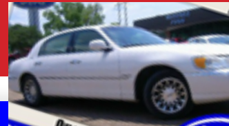
2001 LINCOLN TOWN CAR SIGNATURE $7,700 12057A