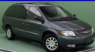
2001 CHRYSLER TOWN & COUNTRY LXI $3,999 B13000