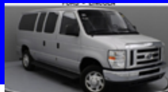
2013 FORD E-350 SUPER DUTY XLT $18,499 12919