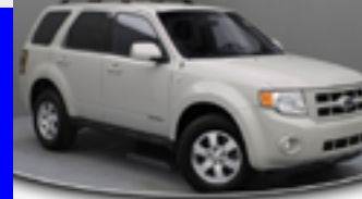
2008 FORD ESCAPE LIMITED 3.0L $11,950 51319B