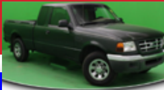
2001 FORD RANGER SUPERCAB FLARE 4.0L XLT A $5,800 12914C