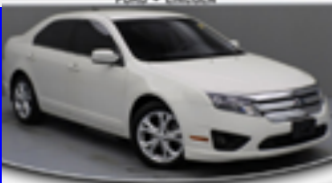
2007 NISSAN ALTIMA 2.5 $9,495 B12978b

CLICK ON ANY VEHICLE FOR MORE INFORMATION!!!