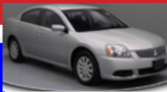
2012 MITSUBISHI GALANT 4DR $13,400 12966