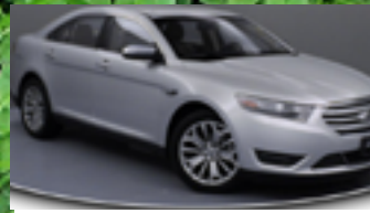
2013 FORD TAURUS LIMITED $24,988 12875