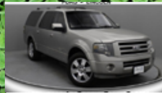
2008 FORD EXPEDITION EL LIMITED $16,400 51319a