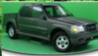
2002 FORD EXPLORER SPORT TRAC4D UTILITY 4WD $8,500 12783a