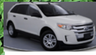
2011 FORD EDGE SE $29,460 12658a