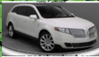
2010 LINCOLN MKT 4DR WGN 3.7L FWD $19,850 12804a