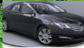
2013 LINCOLN MKZ $30,500 12819