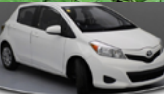
2012 TOYOTA YARIS L $12,988 12881