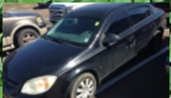
2006 CHEVROLET COBALT LS $700 12772b