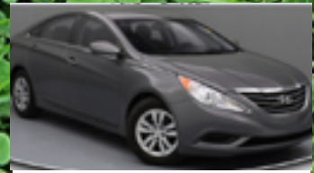
2012 HYUNDAI SONATA GLS W/PZEV $15,988 12877