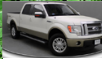
2011 FORD F-150 LARIAT $30,350 51423a