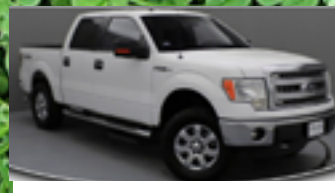
2013 FORD F-150 4WD SUPERCREW 145 XLT $33,500 B12916