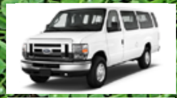
2013 FORD E-350 SUPER DUTY E-350 SUPER DUTY XL $20,000 12919