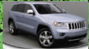
2013 JEEP GRAND CHEROKEE LIMITED $35,300 12797a