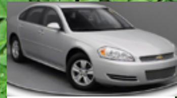
2013 CHEVROLET IMPALA LS $16,200 51284b