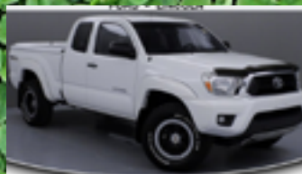
2013 TOYOTA TACOMA V6 $29,200 B12907