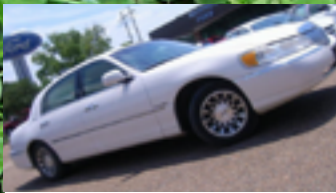
2001 LINCOLN TOWN CAR SIGNATURE $7,700 12057a

CLICK ON ANY VEHICLE FOR MORE INFORMATION!!!