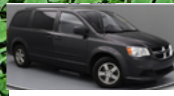
2012 DODGE GRAND CARAVAN SXT $16,495 12878