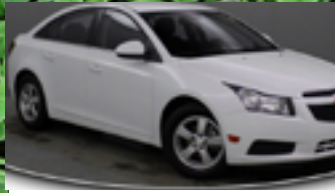
2013 CHEVROLET CRUZE 1LT AUTO $15,395 12864