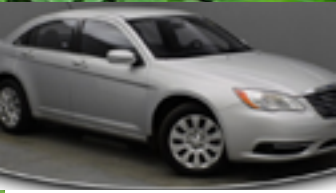
2012 CHRYSLER 200 LX $14,300 12836