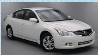
2011 Nissan Altima 2.5 S $15,588 50886B