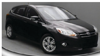
2012 FORD FOCUS SEL $14,923 12639