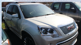
2011 GMC ACADIA DENALI $36,389 51176A