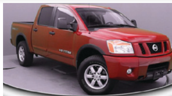
2012 NISSAN TITAN PRO-4X $32,988 12679

CLICK ON ANY VEHICLE FOR MORE INFORMATION!!!