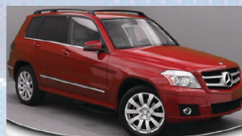
2011 MERCEDES-BENZ GLK350 RWD 4DR GLK350 $30,931 12678A