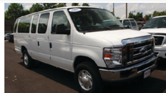
2011 FORD E-350 SUPER DUTY E-350 SUPER DUTY EXT XL $21,988 12642