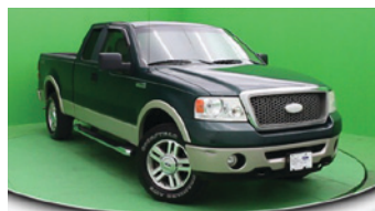
2007 FORD F-150 LARIAT $13,988 50759A