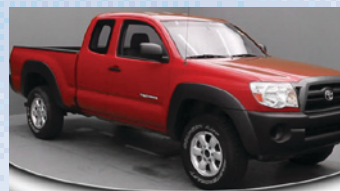
2007 TOYOTA TACOMA V6 $16,988 51158A