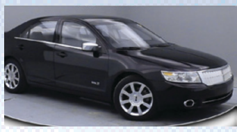
2007 LINCOLN MKZ 4DR SDN FWD $12,433 12639