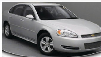
2013 CHEVROLET IMPALA LS $16,988 12673