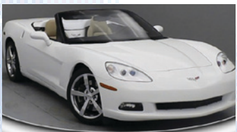
2009 CHEVROLET CORVETTE 2DR CONV W/2LT $34,988 12569