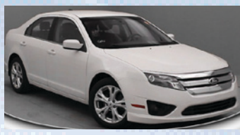
2012 FORD FUSION SE $17,295 12628