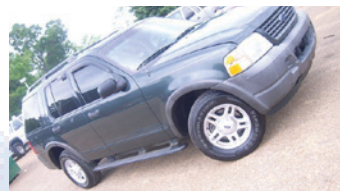
2003 FORD EXPLORER XLS 4.0L $5,000 12591