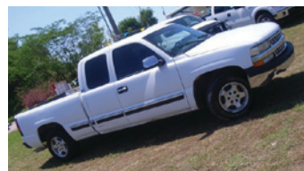
2000 CHEVROLET SILVERADO 1500 LS $5,000 12568