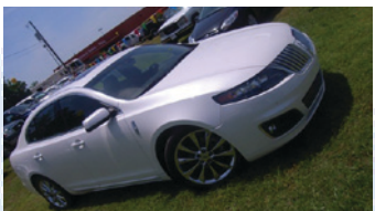
2010 LINCOLN MKS $29,988 12572