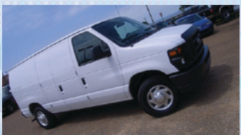
2013 FORD E-150 E-150 COMMERCIAL $18,988 12608