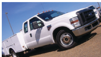
2008 FORD F-350 XL $10,900 51046A