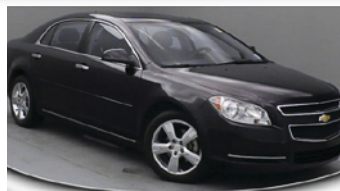
2012 CHEVROLET MALIBU 2LT $15,988 12657