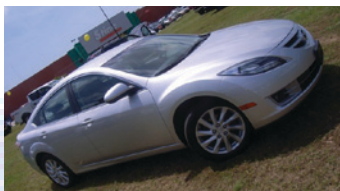
2012 MAZDA 6 TOURING $15,499 12576