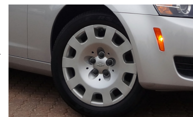
Optional Full Wheel Cover