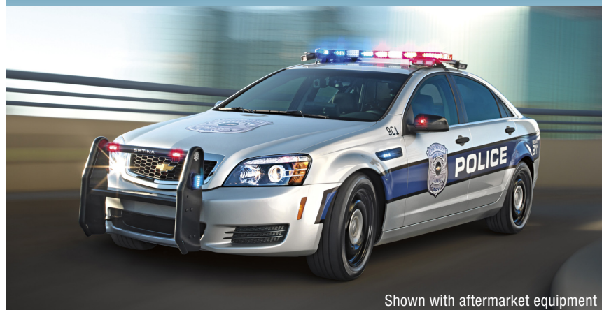
Shown with aftermarket equipment

Backed by a 5-year/100,000-mile limited powertrain warranty 1 and 2-year/24,000-mile scheduled maintenance program 2 , the Caprice cements itself as the elite choice for law enforcement.