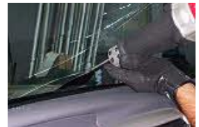
Crack in windshield

A new windshield gives you a clear line of site while driving and reduces glare.